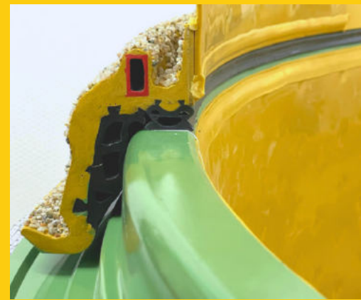
FULLY LINED MANHOLE INCLUDING JOINT LINING