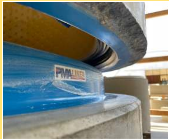
FULLY LINED MANHOLE INCLUDING JOINT LINING